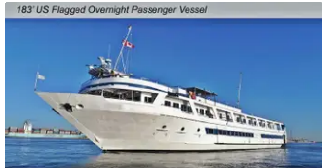
183' US Flagged Overnight Passenger Vessel